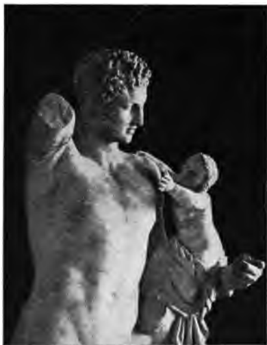
Fig. 25. Hermes from Olympia.

agile, vigorous frame. He wears his winged sandals, often a traveler's hat or a winged cap; otherwise he is usually nude. In his hand he carries his caduceus, or herald's staff, winged at the top, with two serpents twined about it. He most fully expresses the character of the Greek peo-